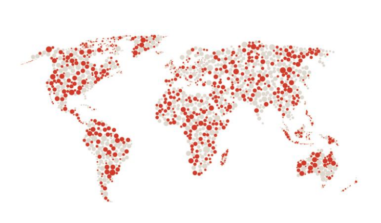
More than 250,000 hotels across 10,000 destinations worldwide

WebBeds provides a user-friendly solution to the global hotel room supply and distribution challenge