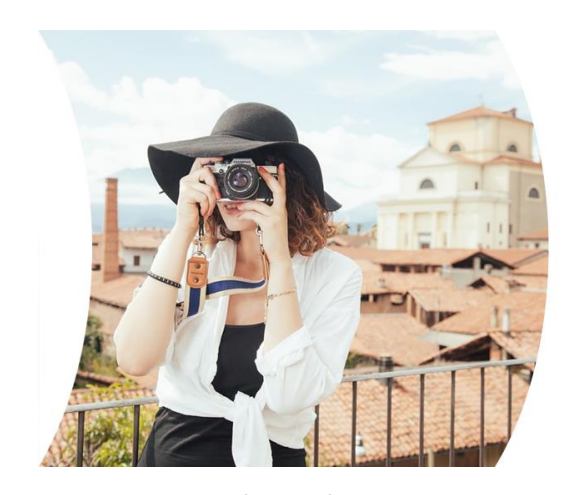
Their clients (The end consumer)

WebBeds act as an intermediary between hotels looking to fill hotel rooms and our clients looking to find rooms for their consumers